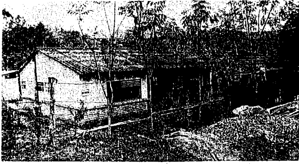
New school addition

The funds going to the family must be put to use in a project which will benefit the welfare of the family. Steve and Pete have begun rabbit- and duck-raising projects patterned after the 4-H program. The hope is to raise the nutritional level of the people and thus their health standards.